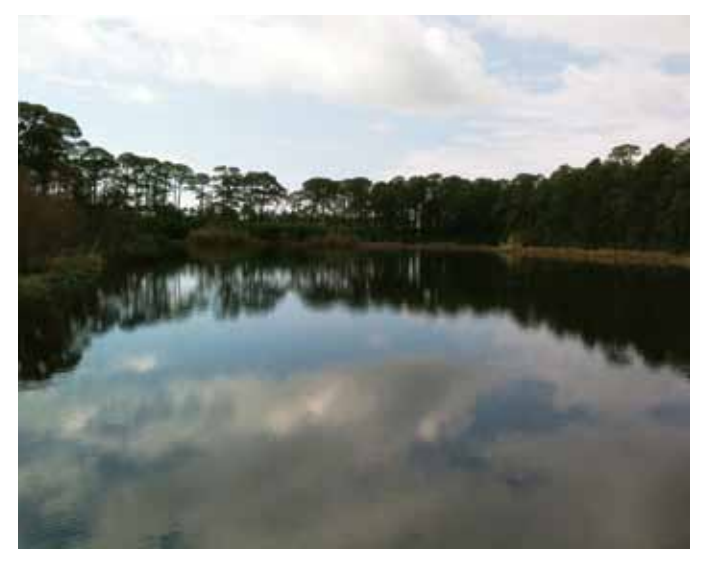
Audubon Bird Sanctuary

The Dauphin Island Public Beach, located at 1551 Bienville Boulevard, is owned and maintained by the Park and Beach Board. This is the most visited beach on Dauphin Island. The beach has beautiful white sands and is great for swimming. Due to recent storms, the beach has extended farther into the gulf and now adjoins Sand Island which, prior to 2008, was only accessible by boat. Park amenities include large pavilions, restrooms, a playground, and picnic tables. Vendors supply a variety of amenities to beach going visitors. Recently, the Park and Beach Board has made significant updates to the parking area and around 300 parking spaces are available. There is a nominal entrance fee to the park. Currently, the 850-foot fishing pier is landlocked. However, it has been modified to provide sightseeing and picnicking opportunities.