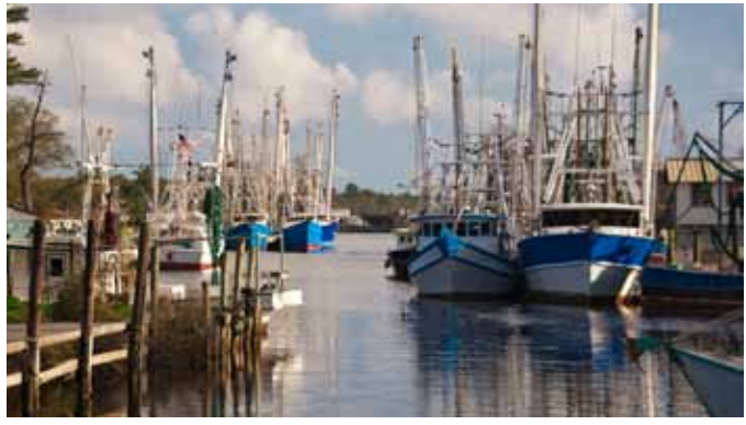
Bayou La Batre

A pedestal/billboard recognizes native birds of the site